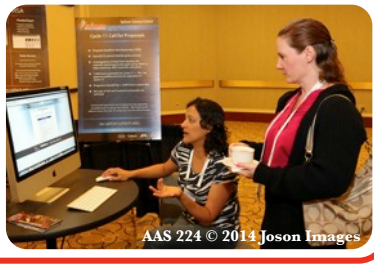
Right. Restrictions on conference participation by NASA scientists, engineers, and program officers harm the scientific enterprise and limit publicprivate collaborations.

Left. We are concerned that the request would reduce funding for SMD STEM Education activities by more than 50% (\$42M \rightarrow \$20M).